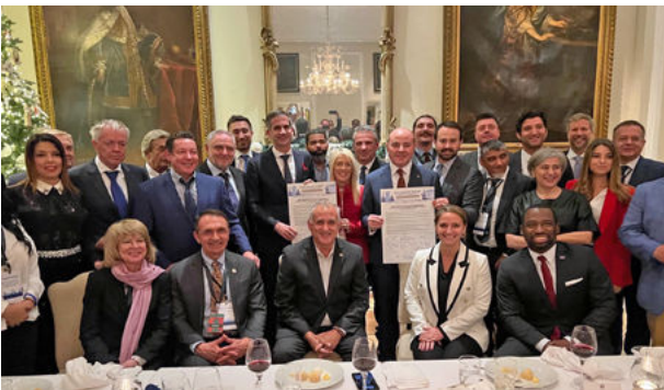
Joint Declaration of Second-Annual Mayors Summit Against Antisemitism in Athens, Greece. (Podimatas)

The continued growth of the definition's across-the-board acceptance was particularly pronounced this past year in the United States, where 18 states adopted it via legislation or executive actions. More than half – 30 – of U.S. states have now done so , as have 56 American counties and cities.