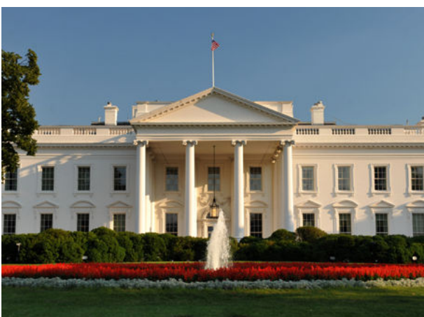
The White House

“It is important to be clear about what antisemitism is,” he added, after reciting the text of the IHRA Working Definition of Antisemitism. “A shared understanding can serve not only the work of the United Nations, but all global efforts to uphold human rights and human dignity.”