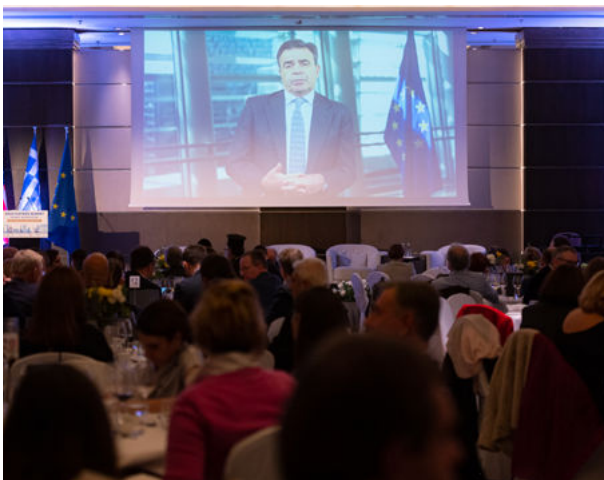
Margaritis Schinas, Vice-President of the European Commission at the opening dinner of the Second-Annual Mayors Summit Against Antisemitism in Athens, Greece.