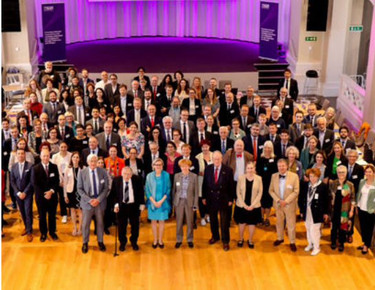
IHRA plenary in Sweden, 2022.

THROUGH DECEMBER 2022, A TOTAL OF 1,116 ENTITIES HAVE ADOPTED OR ENDORSED THE DEFINITION