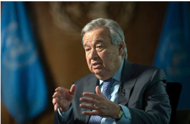
United Nations Secretary-General Antonio Guterres speaks during an interview at the UN Headquarters, on January 20, 2022, in New York.