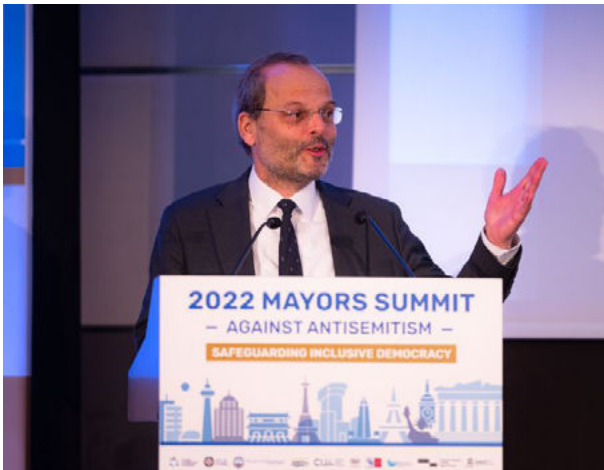
Dr. Felix Klein – the Federal Government Commissioner for Jewish Life in Germany and the Fight against Antisemitism.

At the same time, the European Commission celebrated the first anniversary of the launch of the “European Union Strategy on Combating Antisemitism and Fostering Jewish Life (2021-2030),” which cited the IHRA Working Definition of Antisemitism numerous times.