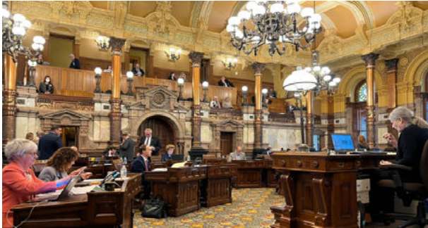
IHRA Working Definition of Antisemitism Adoption. (Twitter)

The continued growth of the definition's across-the-board acceptance was particularly pronounced this past year in the United States, where 18 states adopted it via legislation or executive actions. More than half – 30 – of U.S. states have now done so , as have 56 American counties and cities.